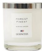
Casual Luxury Forest Finest Scented Candle 395 SEK