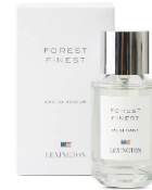
Casual Luxury Forest Finest EdP. 50 ml 495 SEK