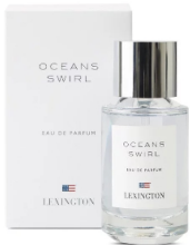
Casual Luxury Oceans Swirl EdP. 50 ml 495 SEK