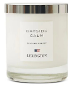
Casual Luxury Bayside Calm Scented Candle 395 SEK