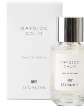
Casual Luxury Bayside Calm EdP, 50 ml 495 SEK