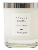
Casual Luxury Oceans Swirl Scented Candle 395 SEK