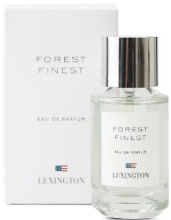
Casual Luxury Forest Finest EdP. 50 ml 495 SEK