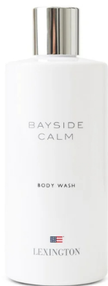
Casual Luxury Bayside Calm Body Wash 225 SEK