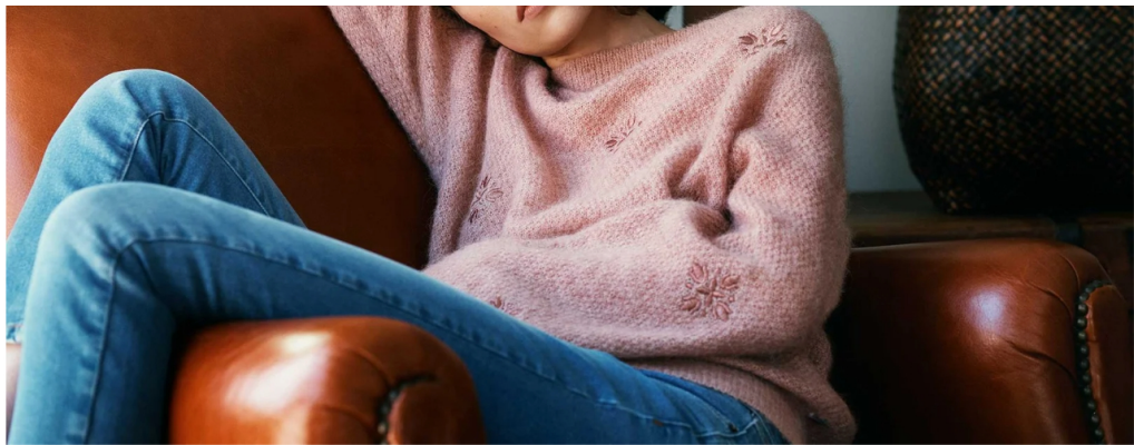
Adelia Alpaca Blend Sweater, Pink 2 295 SEK