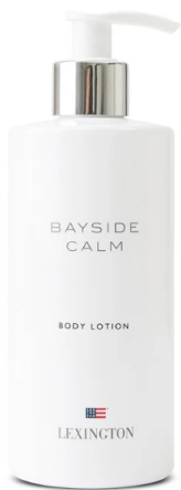
Casual Luxury Bayside Calm Body Lotion 250 SEK