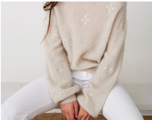
Adelia Alpaca Blend Sweater, Off White 2 295 SEK