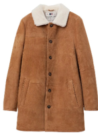
Thomas Shearling Jacket 18 995 SEK