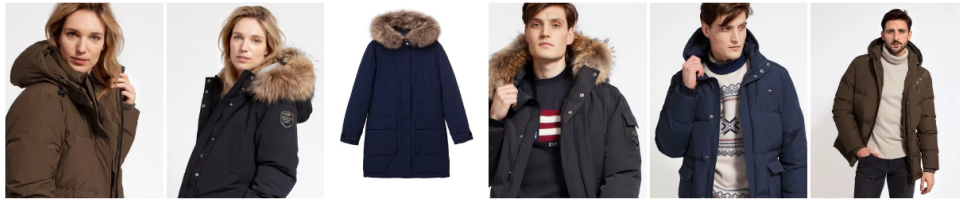
Emma Down Jacket, Hunter Green