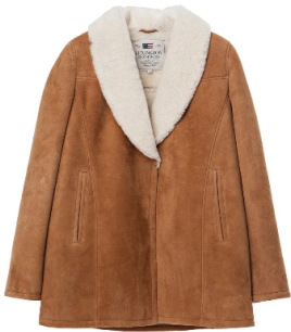
Elisa Shearling Jacket, Chipmunk Brown Sold out