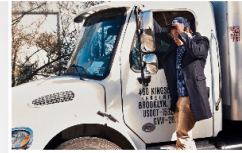
Larry Navy Wool Overcoat