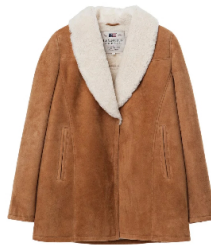
Elisa Shearling Jacket, Chipmunk Brown Sold out 48-995-SEK