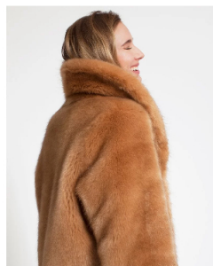
Elisabeth Faux Fur Jacket