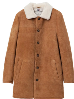
Thomas Shearling Jacket 18 995 SEK