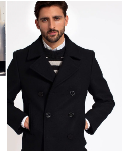
Christopher Peacoat, Deep Marine Blue