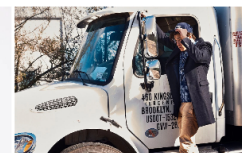
Larry Navy Wool Overcoat