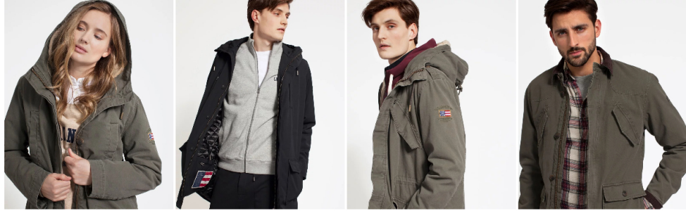
Vera Cotton Parka, Hunter Green

These jackets might not make you invisible if you say something awkward during the dinner, but they will make your wardrobe conundrum go away. Add confidence to a casual outfit with these jackets and see if your in-laws ask you for some style pointers. PS. They work perfectly fine for an apple-picking day with mom.