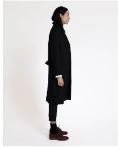
Heather Coat, Caviar Black