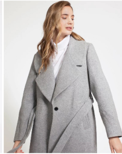
Mila Long Coat, Heather Gray