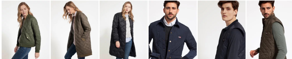
Greta Quilted Jacket, Bottle Green

These lighter jackets are perfect for a casual sunny stroll and look great with jeans. If you're facing a chillier day add some knits and mittens for a warmer walk.