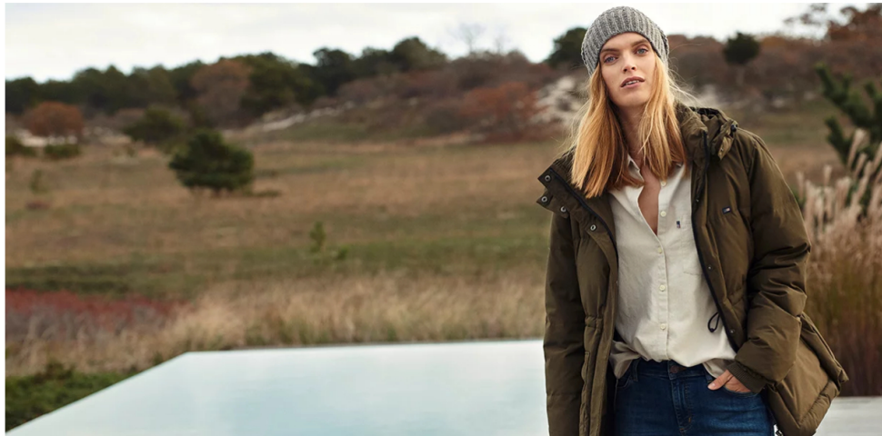
Dave Down Jacket, Hunter Green