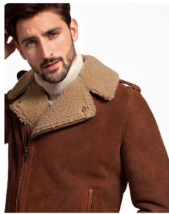
Johnny Biker Shearling Jacket