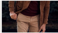
Robert Suede Worker Shirt, Cognac 4 995 SEK