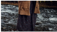
Kathy Suede Worker Shirt, Beige 4 995 SEK