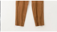
Olivia Suede Pants, Beige 4 495 SEK